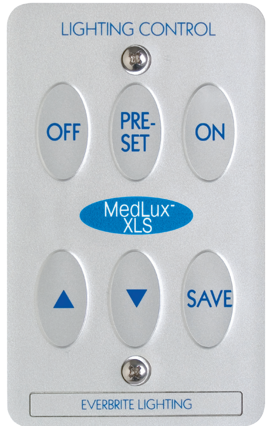
MedLux™ XLS Dimmer - approximate size