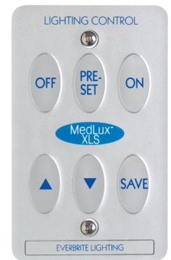
MedLux® XLD Dimmer Keypad

Smooth dynamic operation is achieved without changing color temperature from the MedLux® XLS down lights and remains 100% MRI safe.